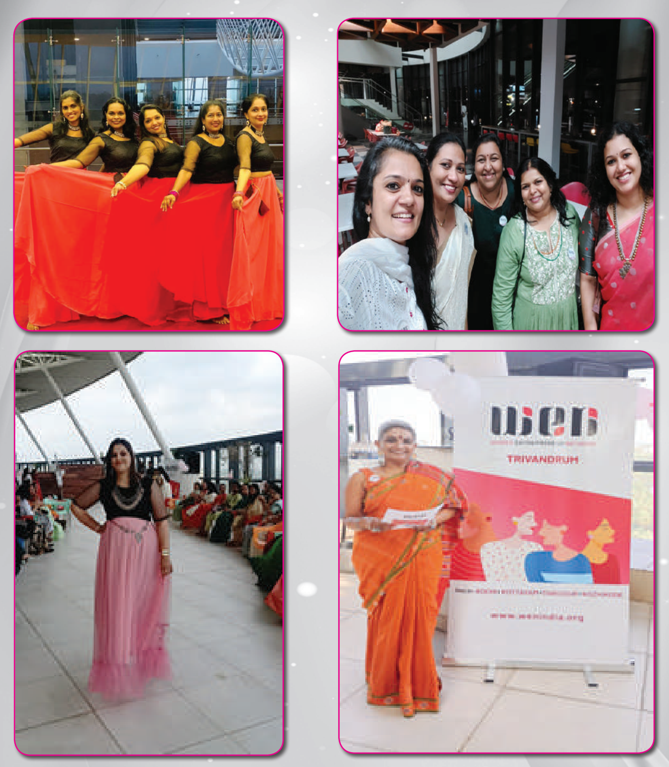
26 January, 2023 - Networking and Fashion show by the members were organized. Each member actively participated.