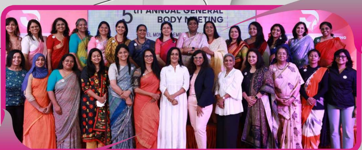
COMMITTEE & ADVISORY BOARD MEMBERS 2022-2023