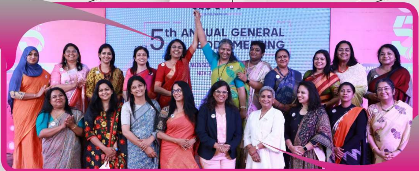
HANDING OVER TO THE NEW COMMITTEE