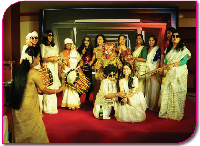
The entertaining dhamaka by the members. Beautifully choreographed Pulikali and Chendmelam