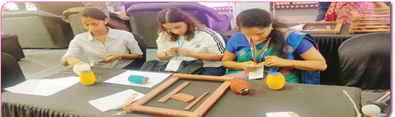
Concentrating on weaving to produce textiles and fabrics