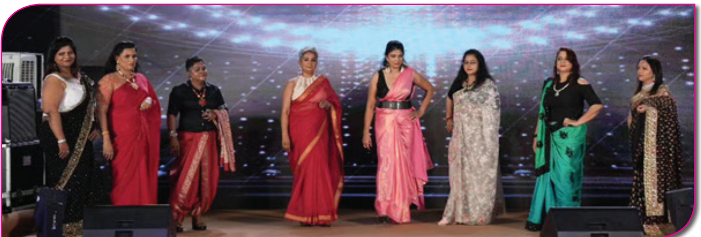
Beauties sashayed their best outfits