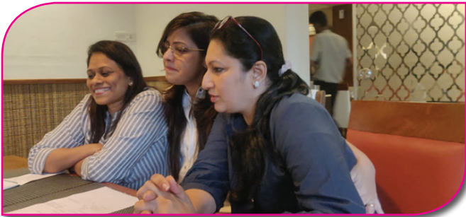
Get Set Ready Go - The master brains behind the Carnival