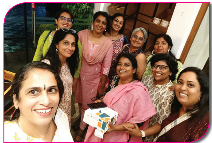
Goal Diggers and Soar High Meetup on May 9th