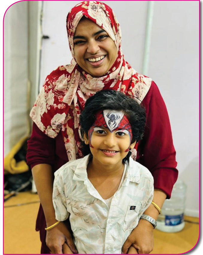
Smiles Shining - Splashes of Fun and Frolic