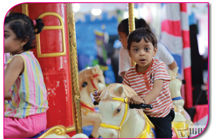
Our little ones in full swing