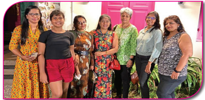
Lucky Charms Meeting - May 8th

Buddy group meetup was held on various dates as an informal gathering of members who came together to socialize, spend time together, and network the business. While the focus was on socializing, the presence of business-minded members naturally led to networking, discussed their businesses, and exchanged ideas.