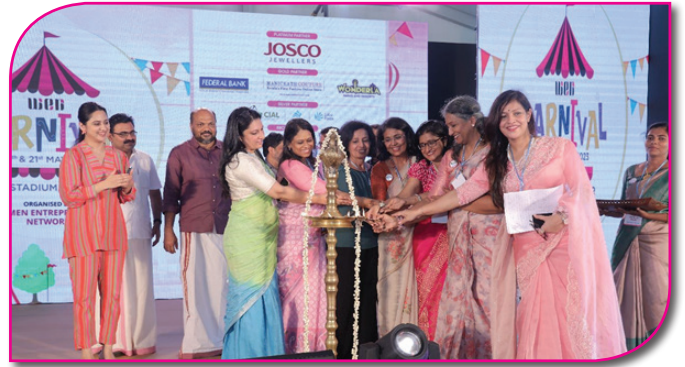
WEN Carnival committee members lighting the lamp symbolising unity and empowerment : United we stand and light the world around us with joy