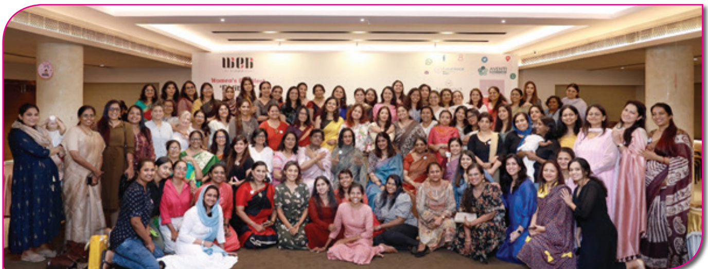
The power of WEN Kochi - Its Amazing members