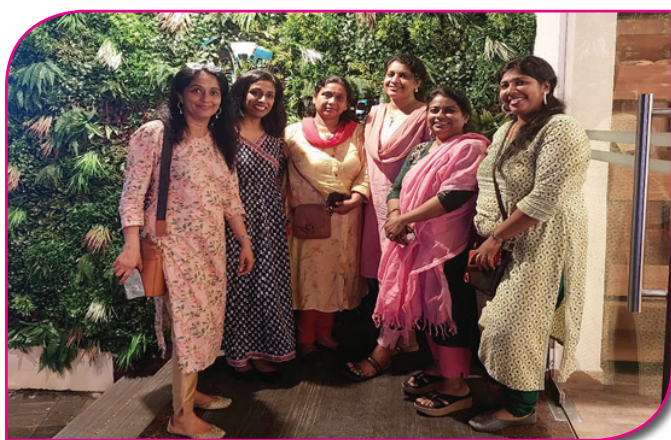
Goal diggers Meetup May 9th