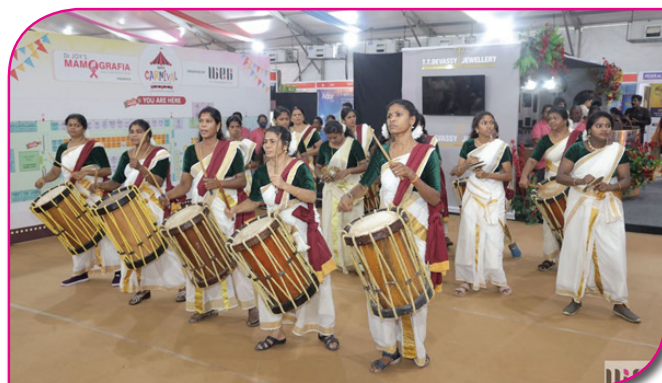
All women Shingarimelam team welcoming our dignitaries in style