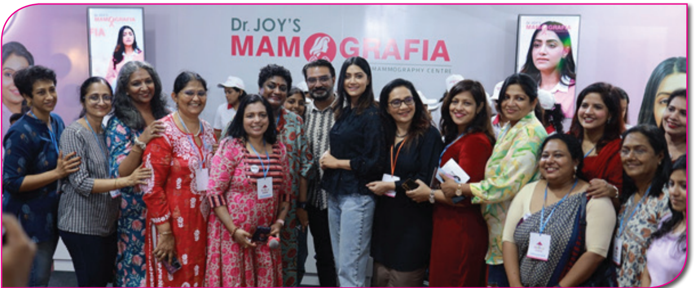
Special Guest Ms. Mamtha Mohandas