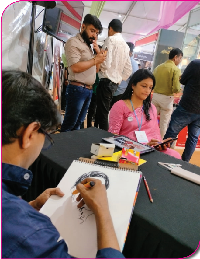
Caricature artist draws quick and entertaining caricatures of visitors