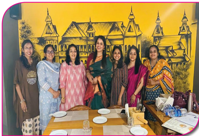
Dashing Divas Meetup on May 6th