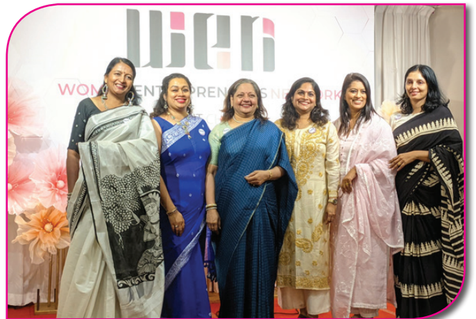
Representatives from Advisory Board members from Foundation attend the AGM