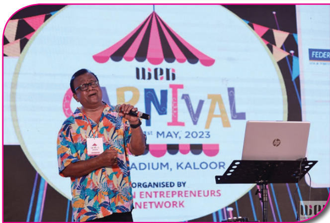
All sing fun at WEN Carnival