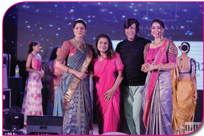
Jaw dropping gorgeous women in spectacular drapes