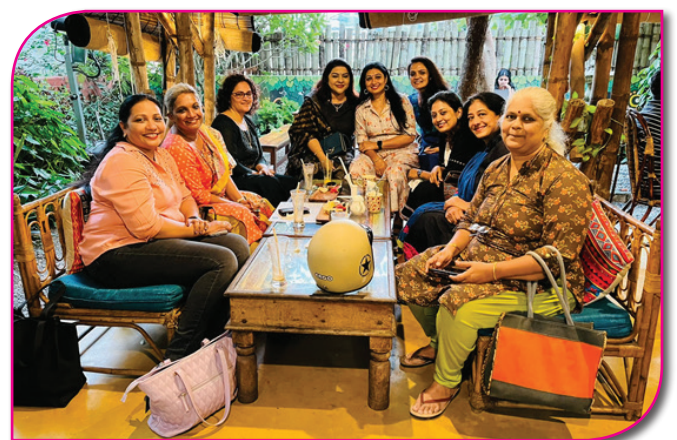
Queen Bees Buddy Group Meeting