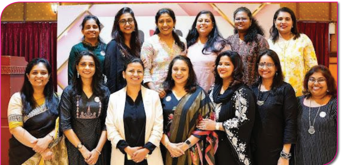
Outgoing and incoming committee members