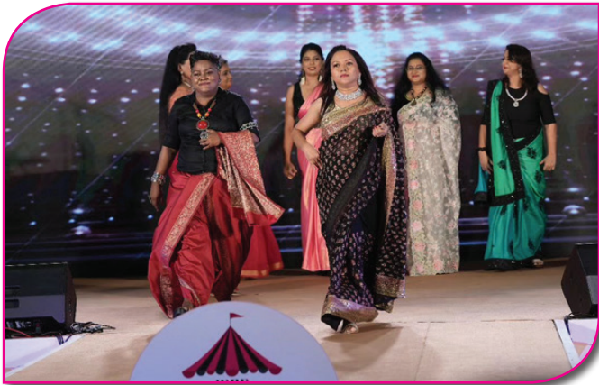
Wennites setting the stage ablaze