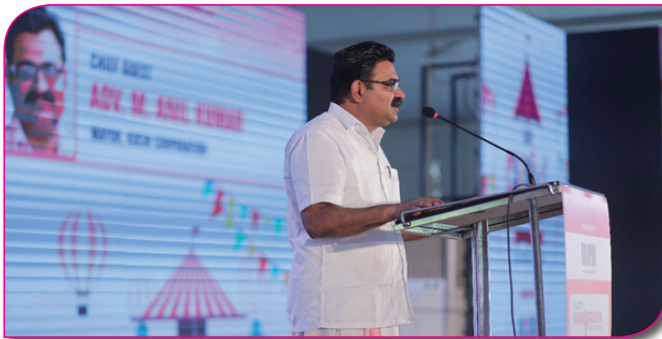
Adv. M. Anilkumar, Mayor of Cochin Corporation addressing the gathering