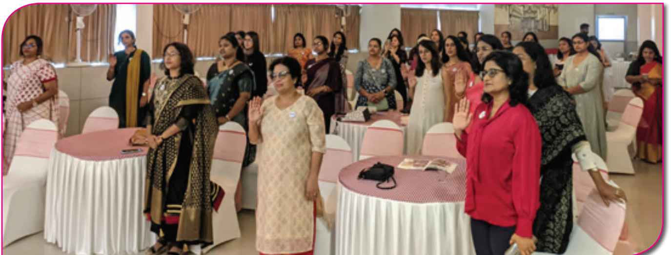
Oath taking by the members