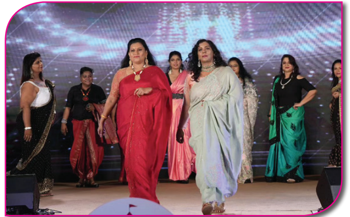
Fashion Show by WEN Members