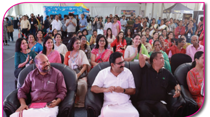
Invited dignitaries, members and guests