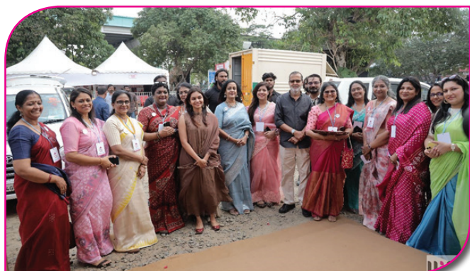
Esteemed dignitaries arriving for inaugurating WEN Carnival on May 21, 2023