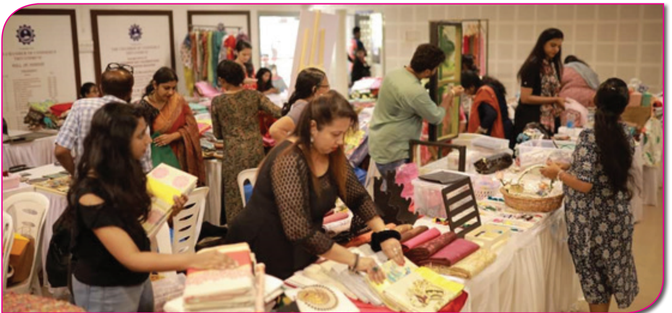
Vendors at WEN Bazaar

The WEN Bazaar was held on 31st March and 1st April at TCCI Hall and Lakshmi Menon Memorial Hall. In addition to 24 stalls, there were workshops conducted by WEN members. The vendors showcased products like clothing, jewellery, resin art, home linen and more.