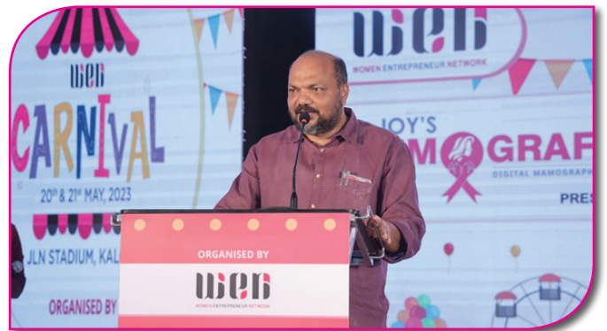
Minister Shri P Rajeev addressing the gathering at the inaugural of WEN Carnival